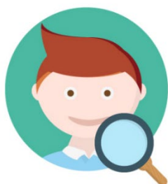
1. Find a friend