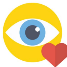
3. Visualization of APCC Activities